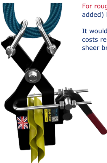
The 'Crab Clamp' Lifting Device

Thankfully, innovations within the industry have helped creat several pre-fabricated and task-specific clamps, with the latest on the market being the Crab Clamp , specially designed to hold several sheets at a time, and can be operated without the need for the Labourer (or whoever is on the ground) without them needing a scaffold spanner.